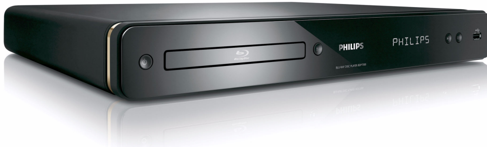
Philips Blu-ray Disc player